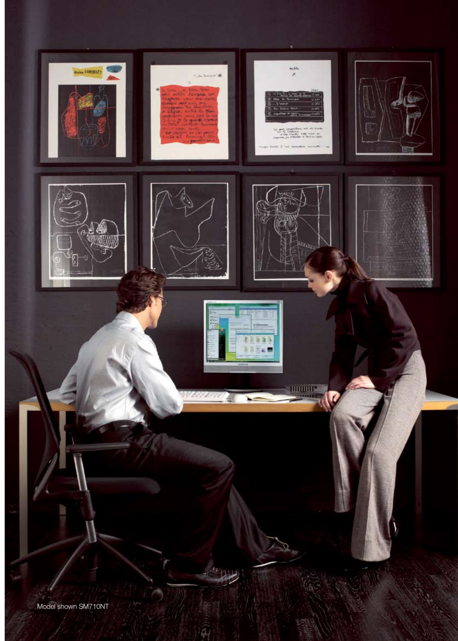
Model shown SM710NT